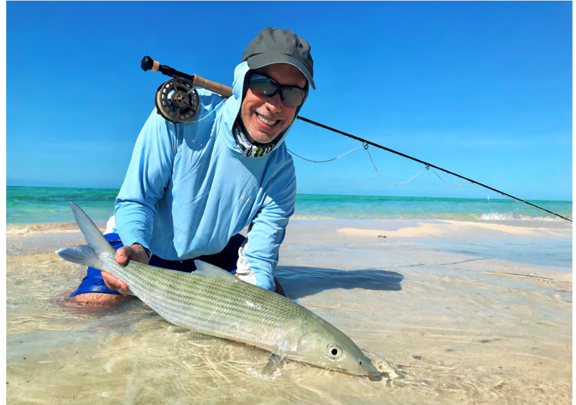
Immerse yourself in the pristine beauty of the Bahamas' southern white sand flats, where trophy-sized bonefish thrive.