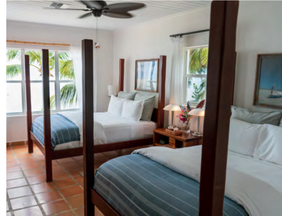
Bedrooms have terracotta tile flooring, white cotton sheets, as well as tropical-weight duvets, and plenty of down pillows.

Our unpretentious and air-conditioned living room and dining room areas have comfortable sofas, plenty of reading material and face the ocean. Here you will find your buffet breakfast laid out each morning. The lodge has a main bar fully stocked with spirits, cold beers, soft drinks, plenty of ice, a blender, and mixers for cocktails.