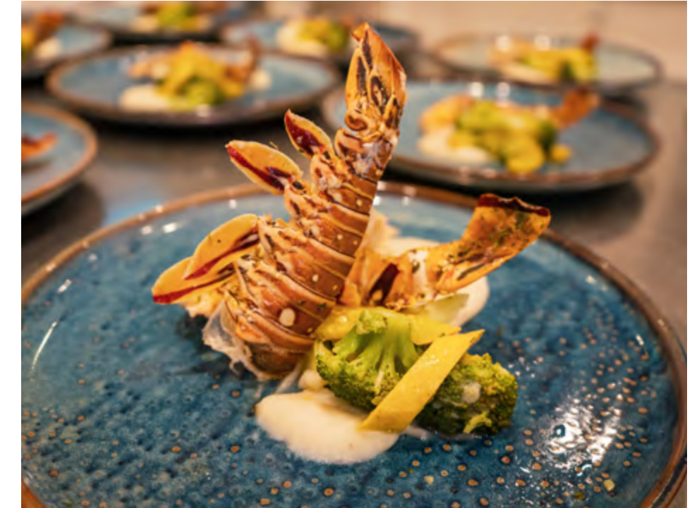
Roasted Crawfish. Food in the Bahamas is a magical encounter between the sea treasures, history, culture & its people.