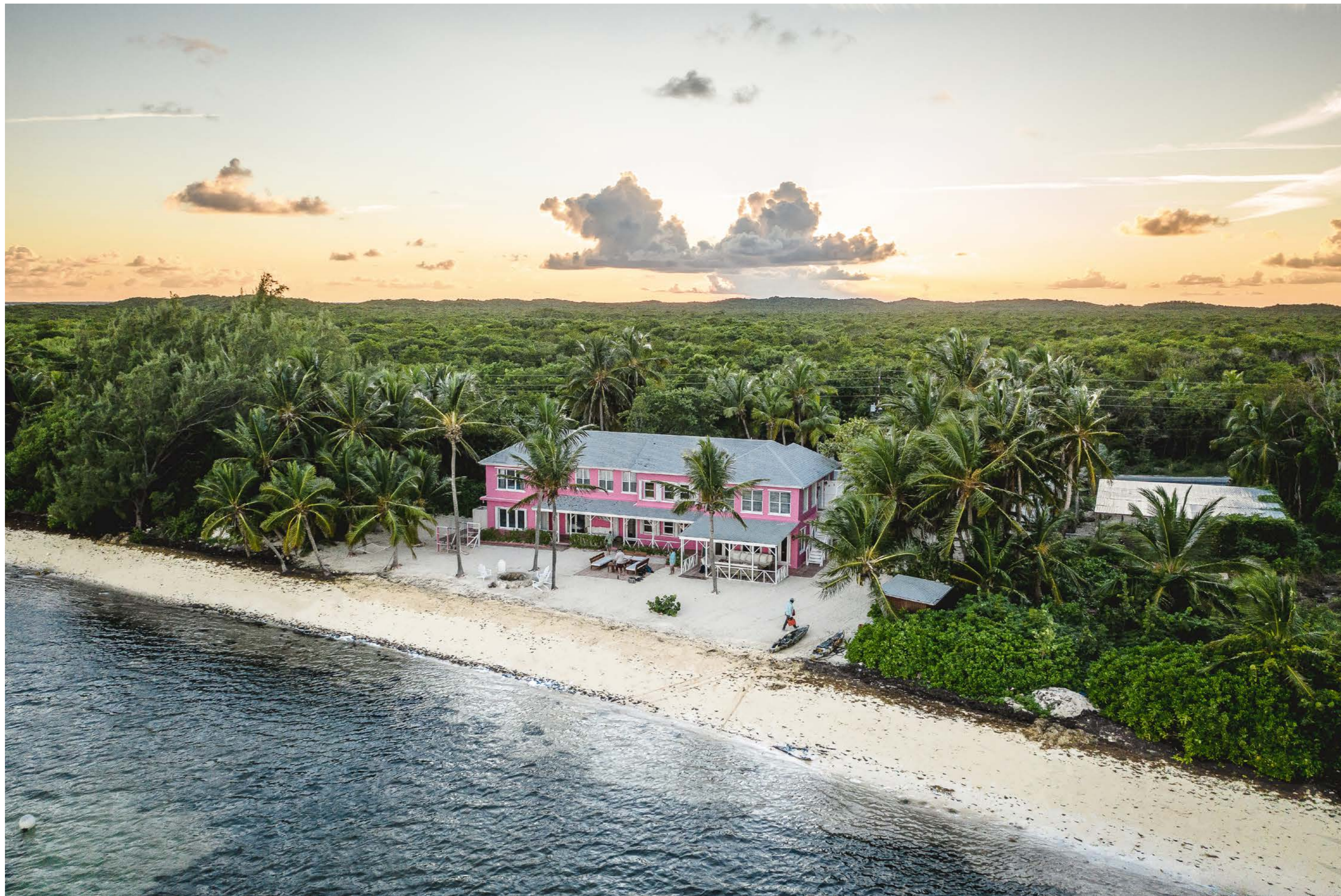
Bairs' Lodge is ideally located in front of the ocean, removing the need for trailering