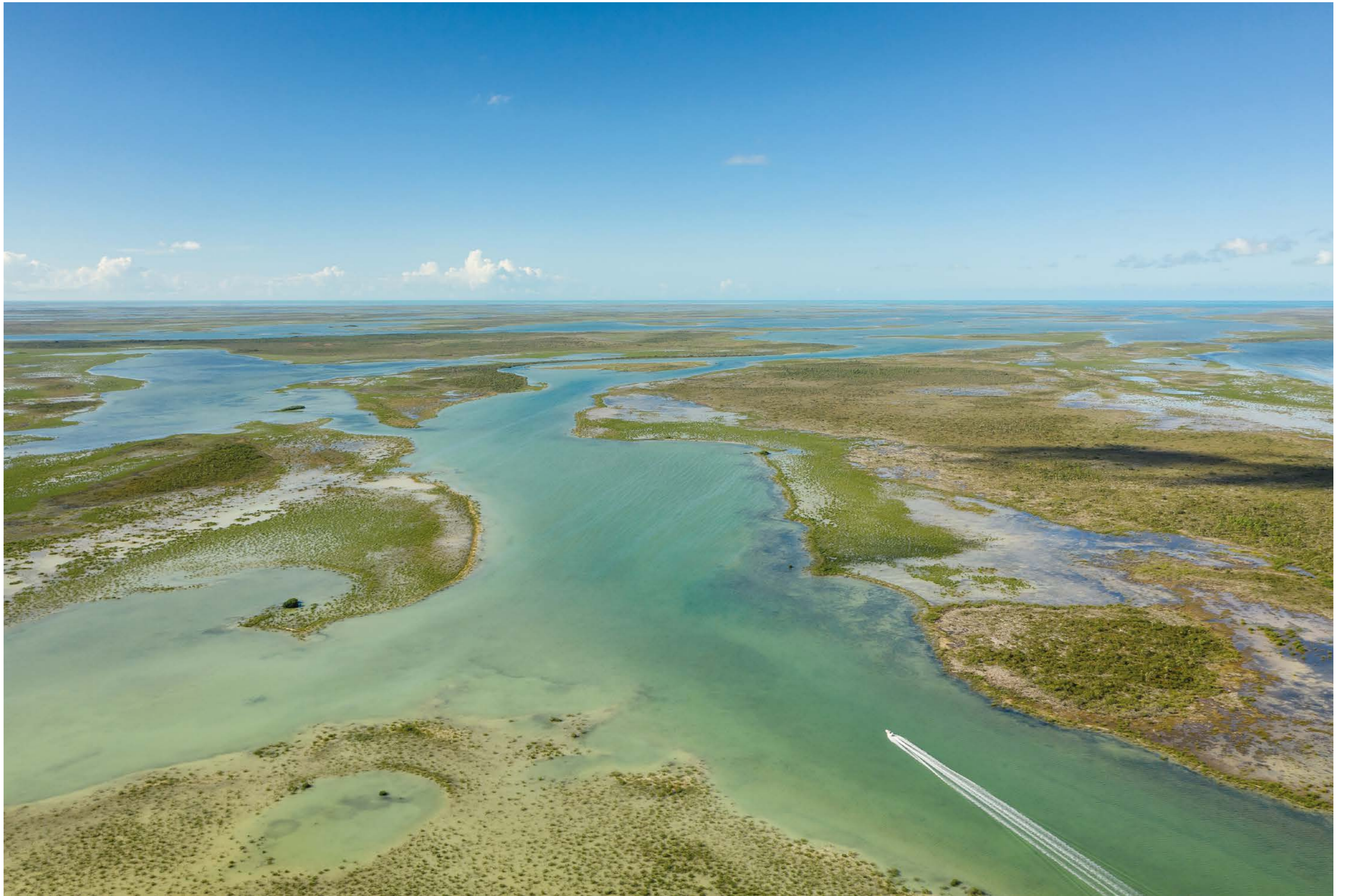
The lodge is a five-minute skiff run north or south to either Deep or Little Creek