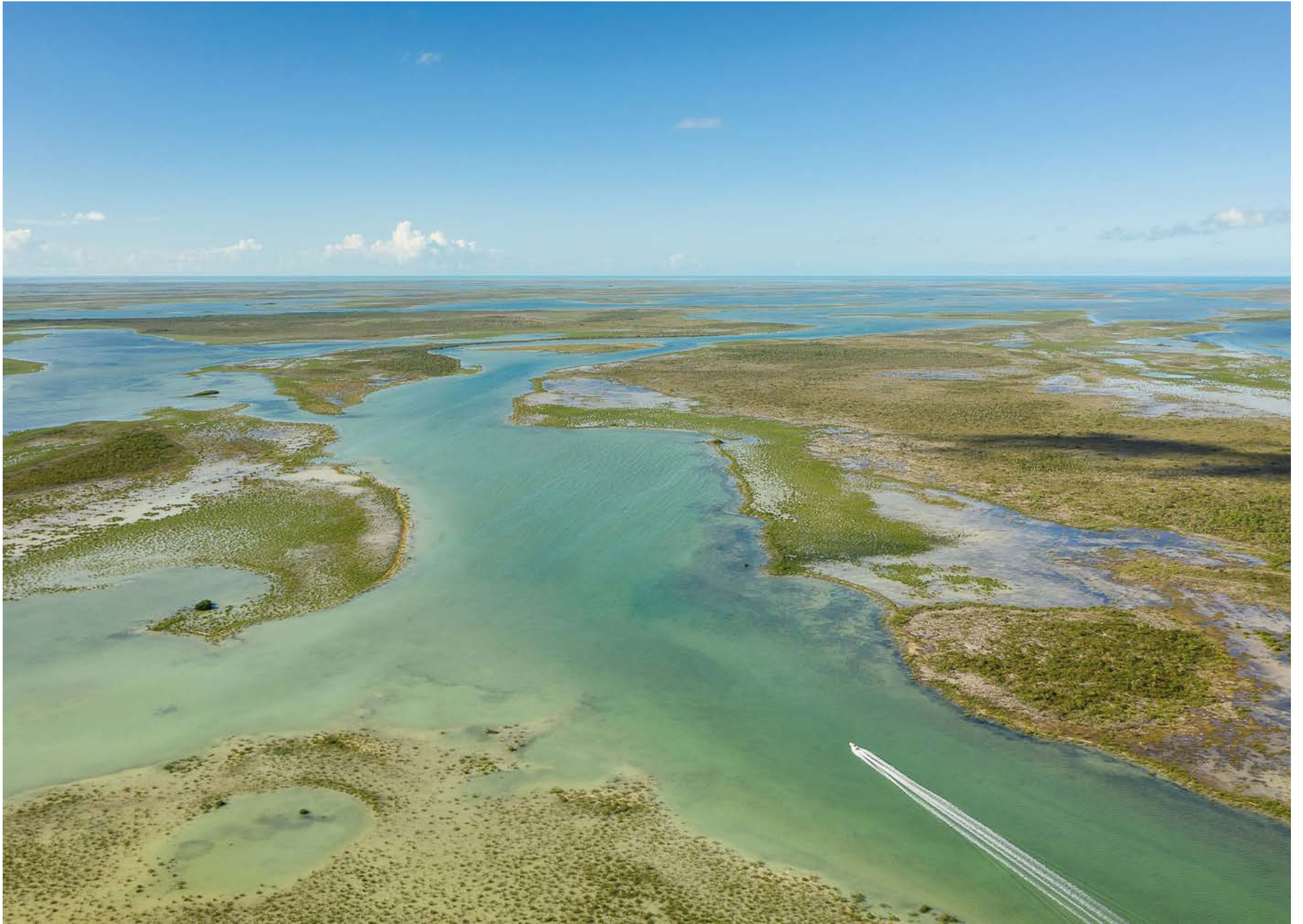
The lodge is a five-minute skiff run north or south to either Deep or Little Creek.