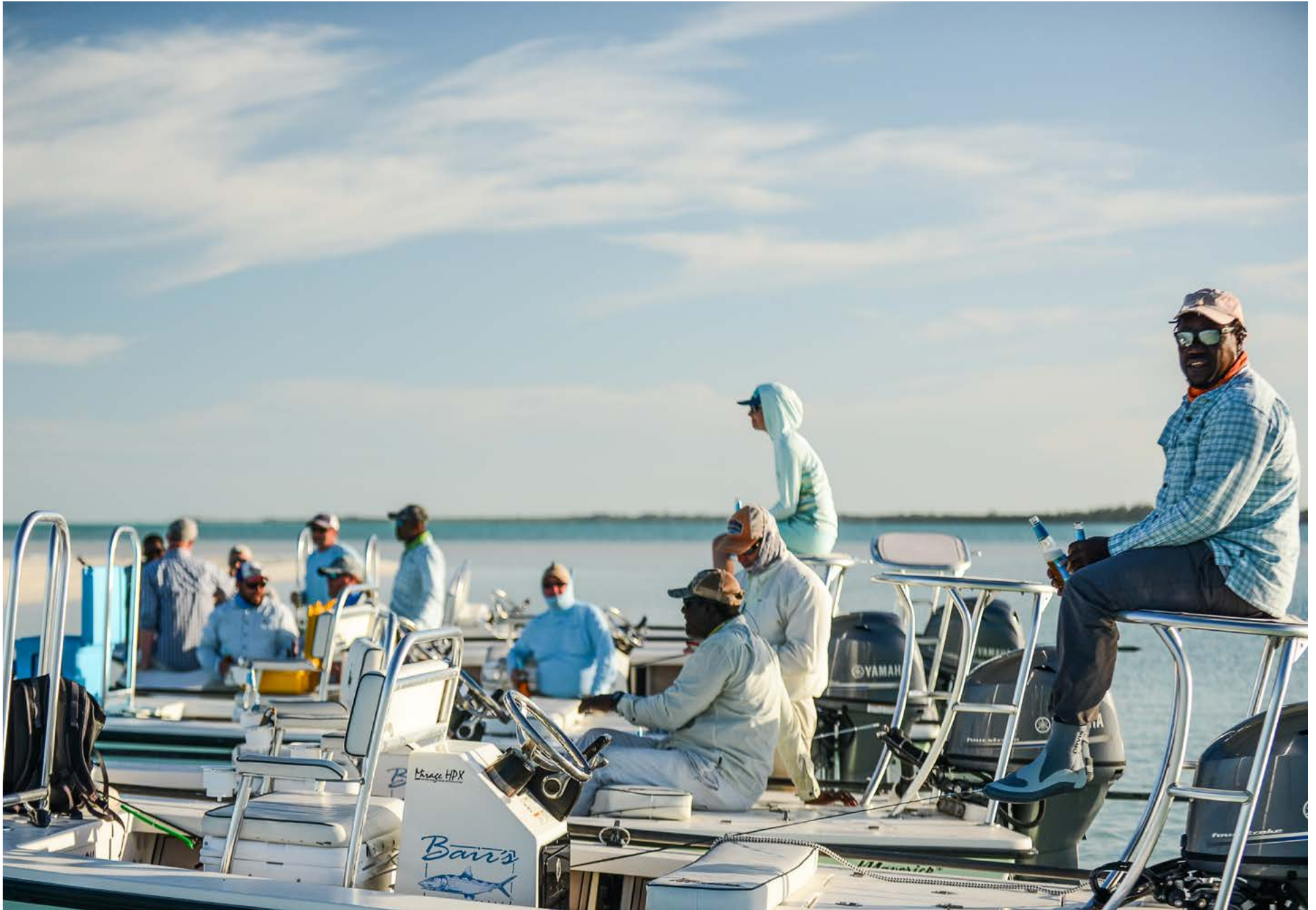
Our veteran guiding staff is one of the best in the Bahamas –professional and personable they can put you on the fish and help you iron your double haul.