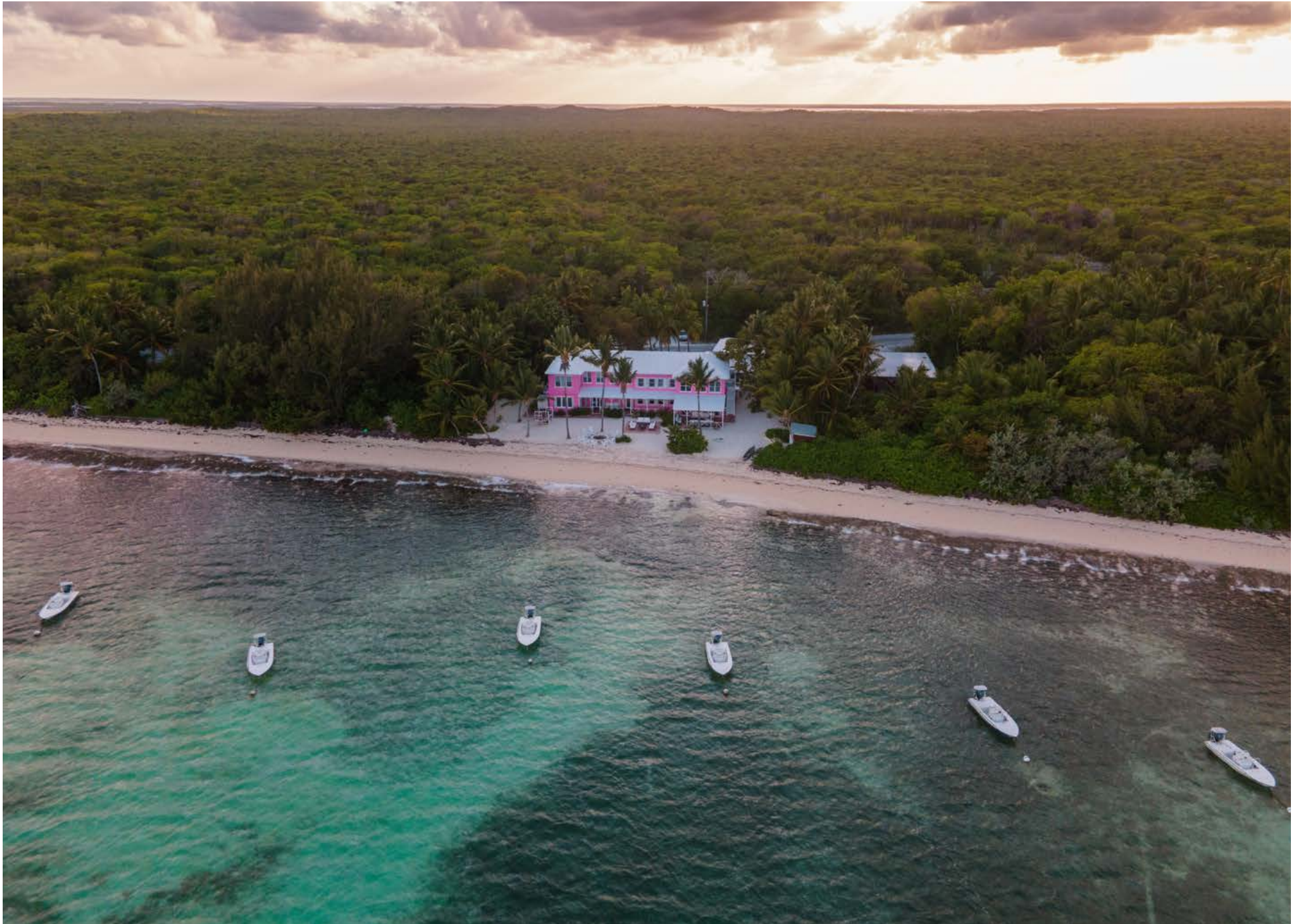
Bairs' Lodge is ideally located in front of the ocean, removing the need for trailering.