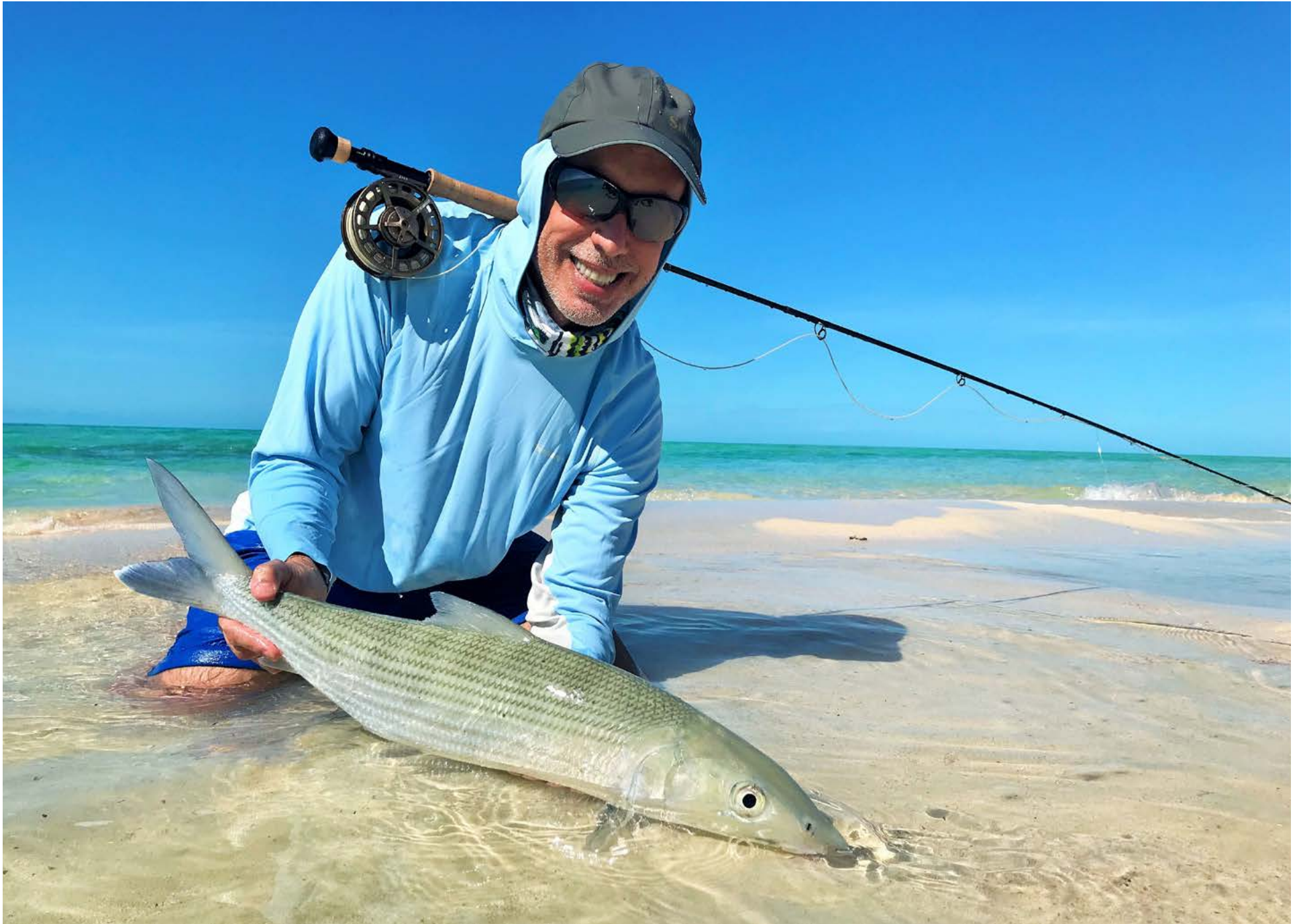
Immerse yourself in the pristine beauty of the Bahamas' southern white sand flats, where trophy-sized bonefish thrive.