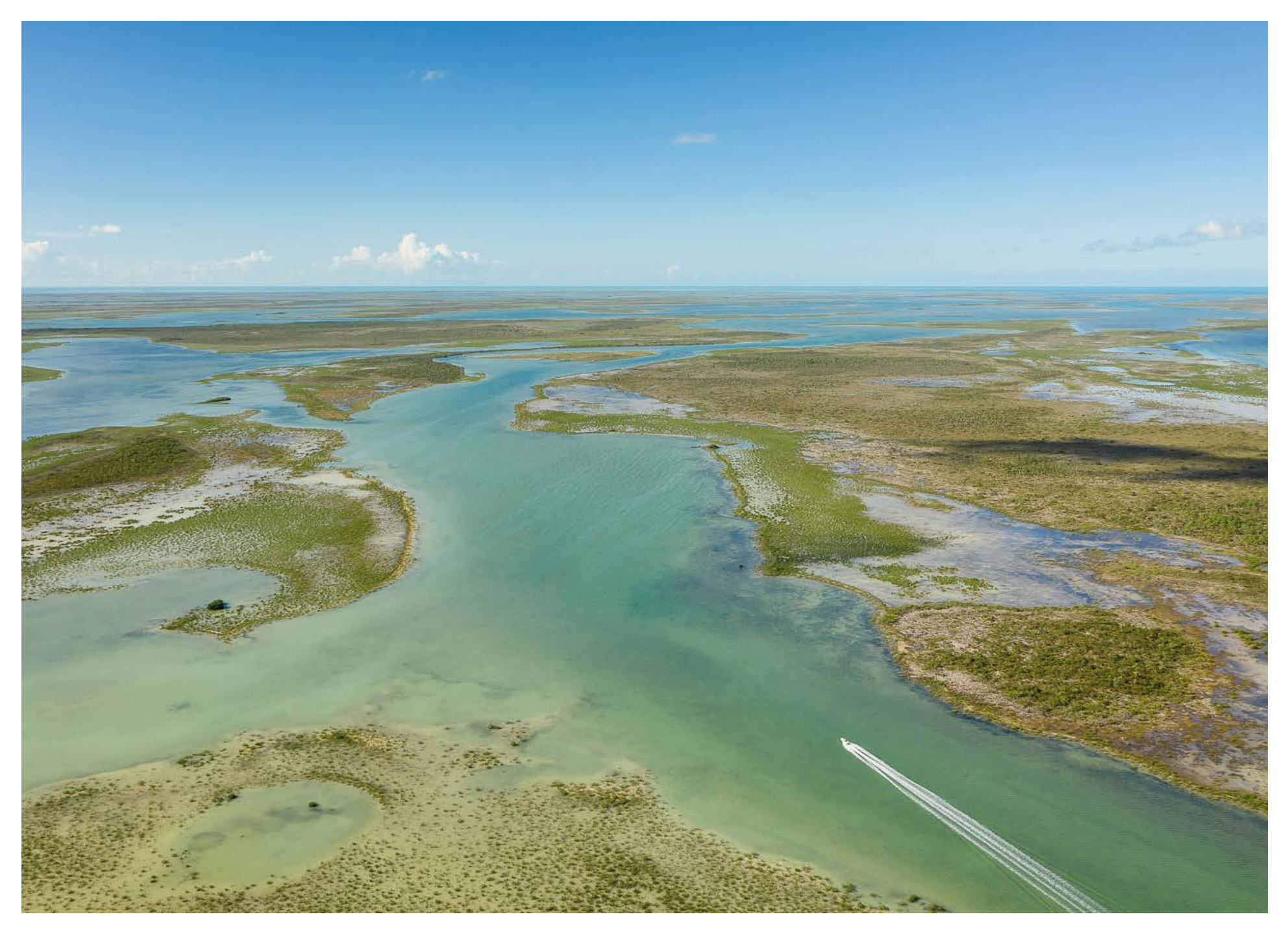
The lodge is a five-minute skiff run north or south to either Deep or Little Creek.