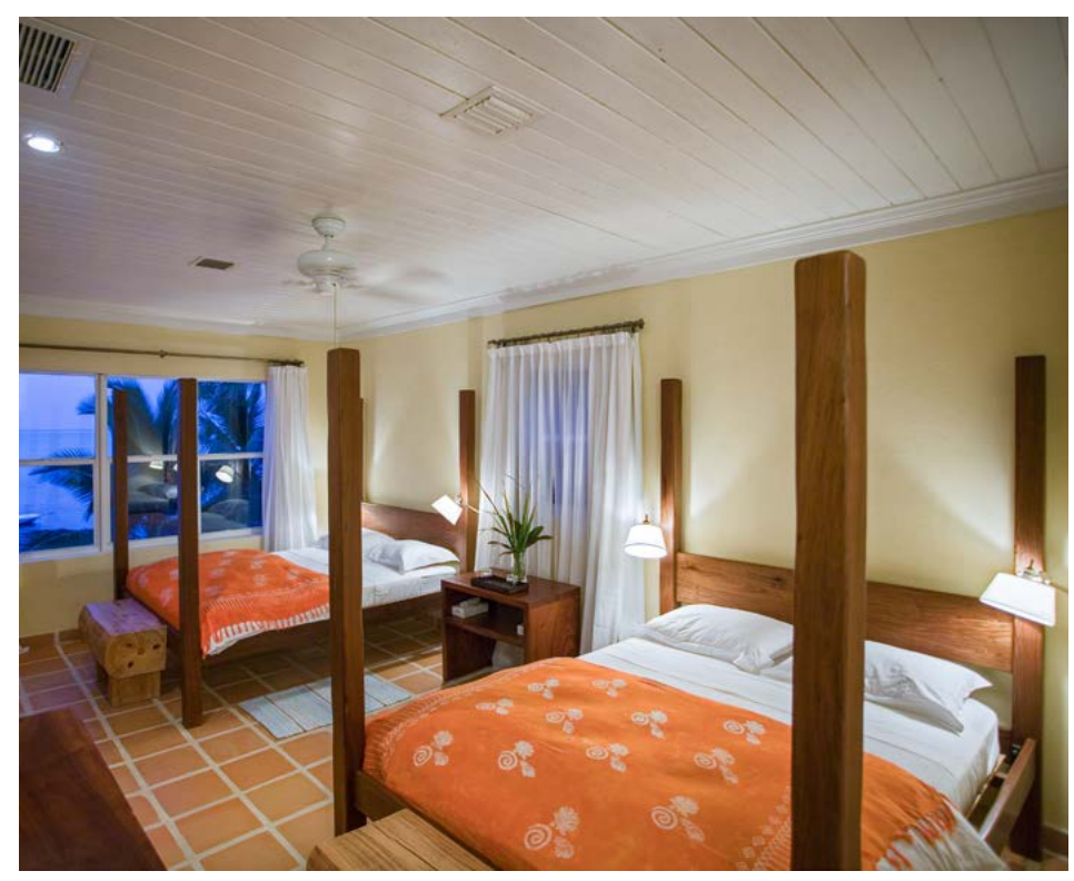
Bedrooms have terracotta tile flooring, white cotton sheets, as well as tropical-weight duvets, and plenty of down pillows.