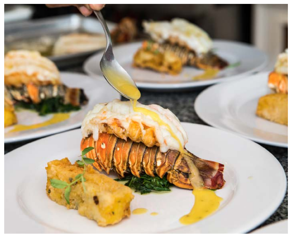
Roasted Crawfish. Food in the Bahamas is a magical encounter between the sea treasures, history, culture & its people.

concentrating on magnificent fresh seafood.