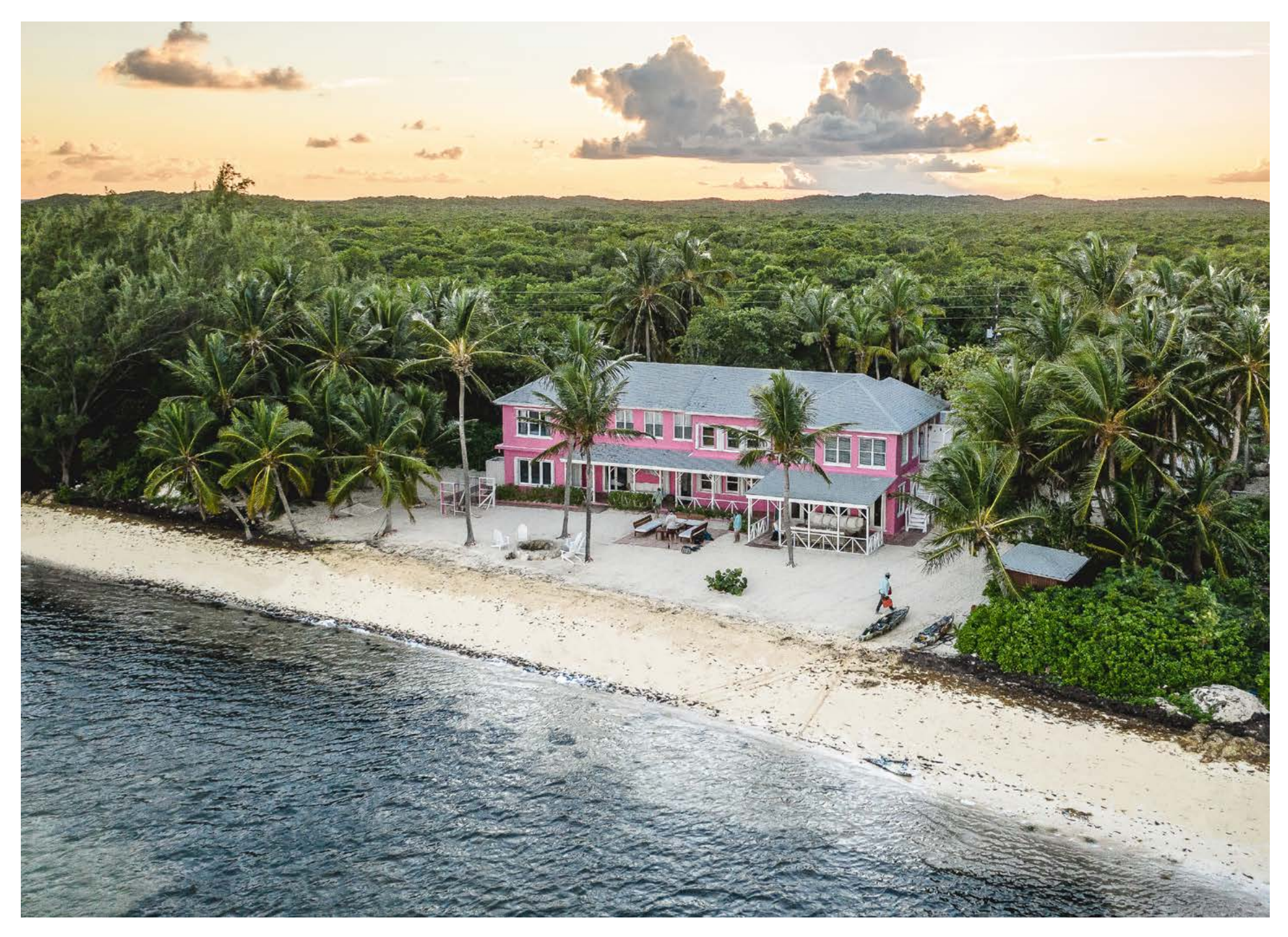
Bairs' Lodge is ideally located in front of the ocean, removing the need for trailering.