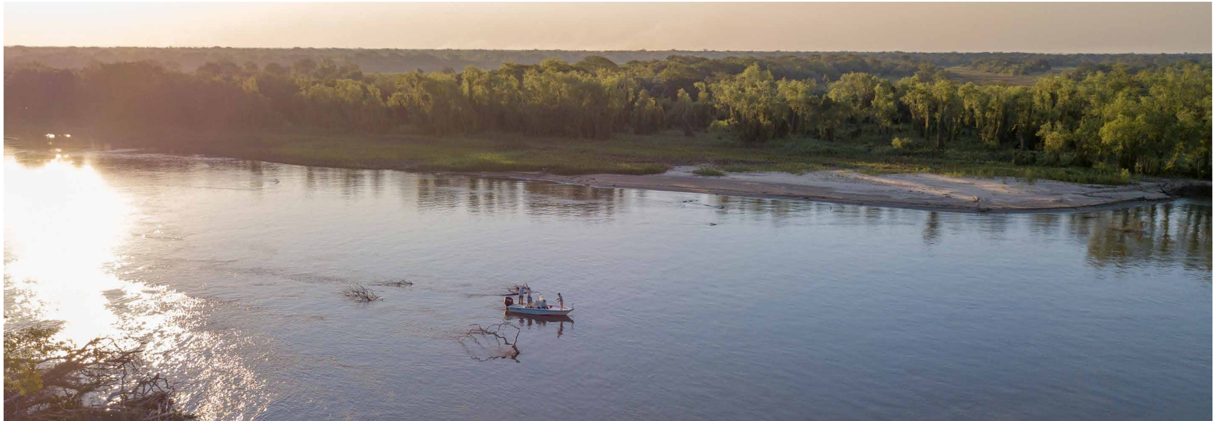
Situated in the middle section of the Río Paraná, you'll explore remote backwater creeks and fish every structure the river offers, from submerged trees to cut-banks and deep channels.