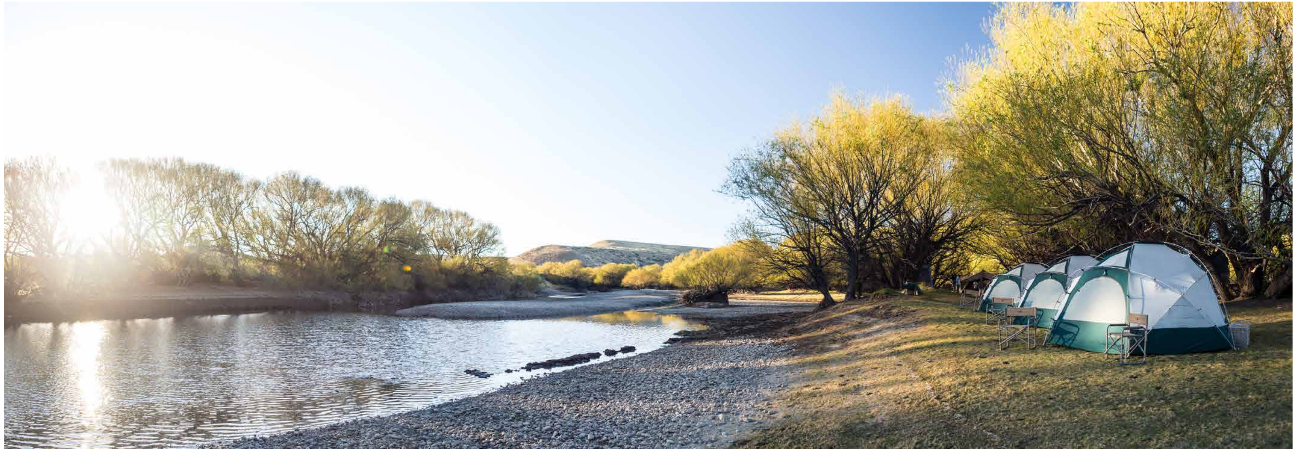
Go back to basics with the Unplugged camps experience alongside our partners from PRG, including a high level of service and amenities, as well as the possibility to fish unpressured waters.