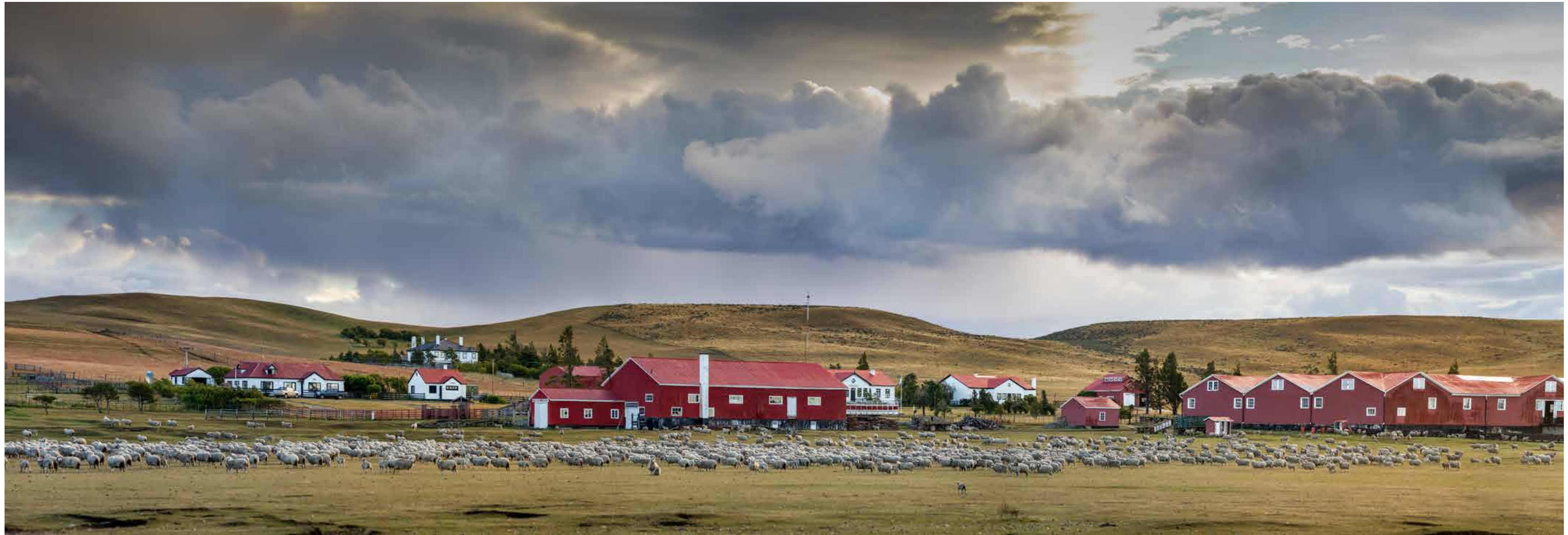
The lodge is located within the expansive 130,000-acre Estancia José Menéndez, which was established in 1894. The Estancia is one of the 5 largest sheep ranches in the whole of Patagonia, processing and sheering tens of thousand of sheep every spring.