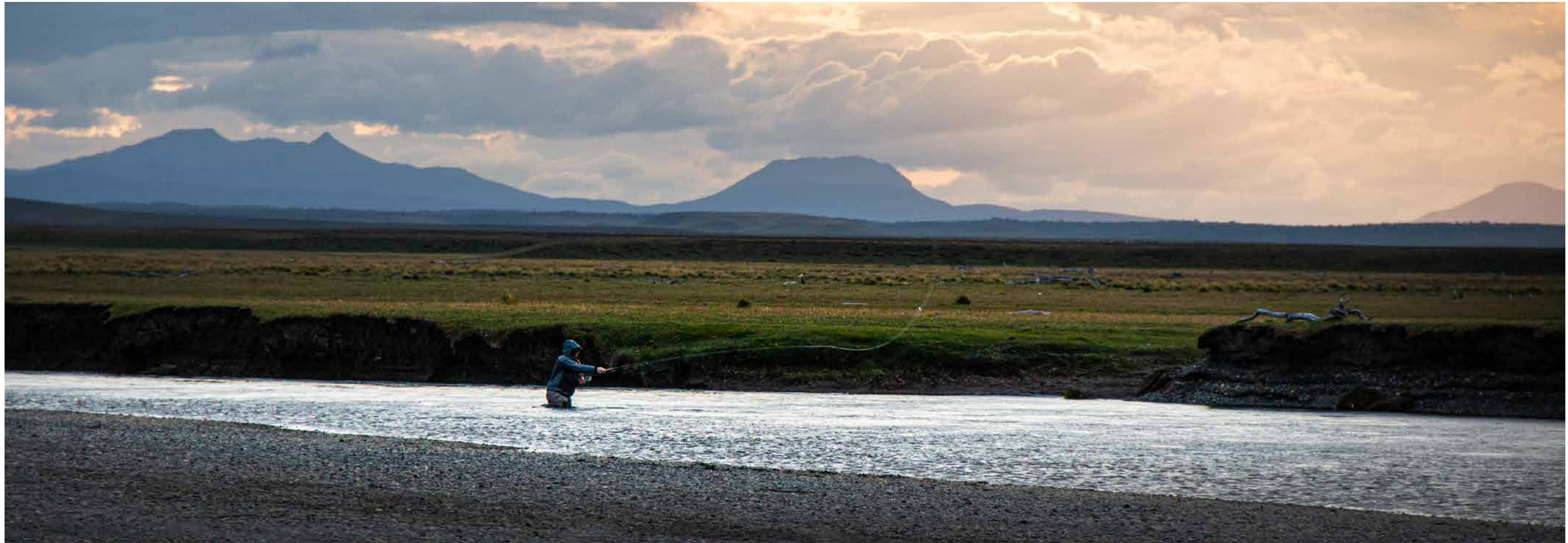
Kau Tapen is located on the heart of the Rio Grande, the most productive sea-run brown trout fishery in the world, and the easiest river you'll ever wade, with a gravel bottom and even flow.